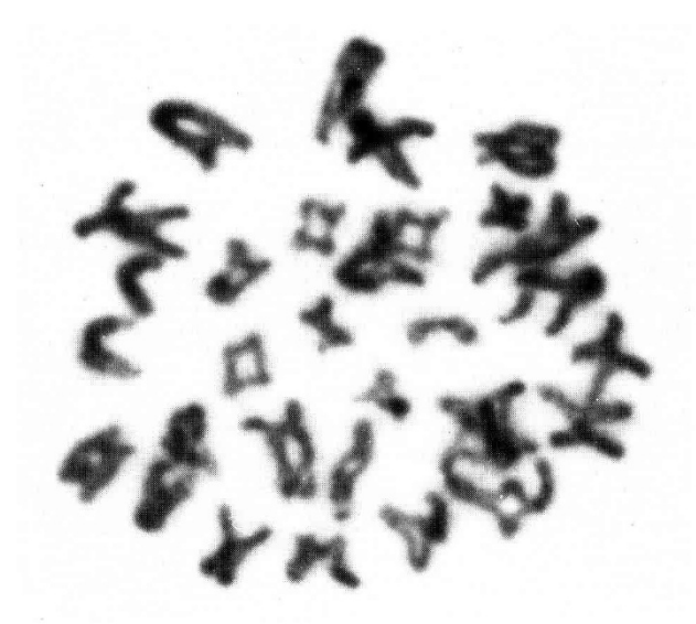
Fig 1. Chromosomes from a bovine oocyte at diakinesis after in vitro culture for approximately 10 h.