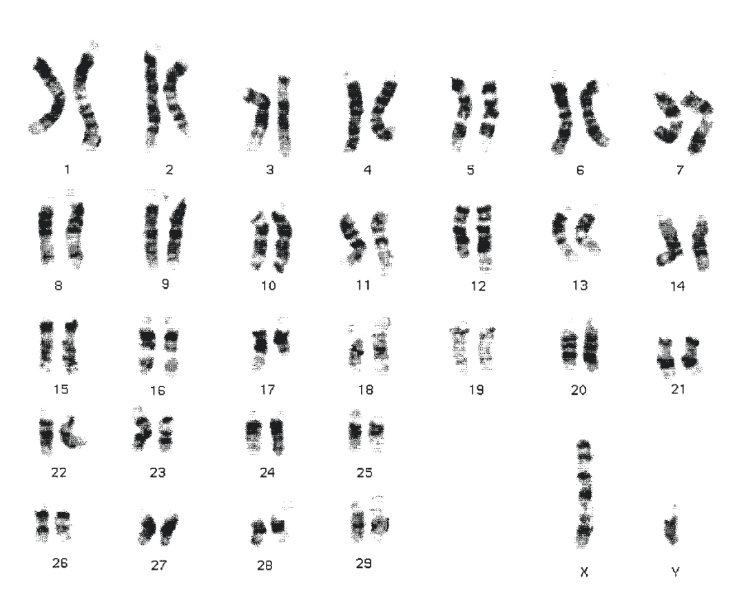
Figure 2. GTG-banded karyotype of the bull heterozygous carrier of the 12/17 reciprocal translocation (normal chromosomes are on the left, translocated chromosomes on the right).