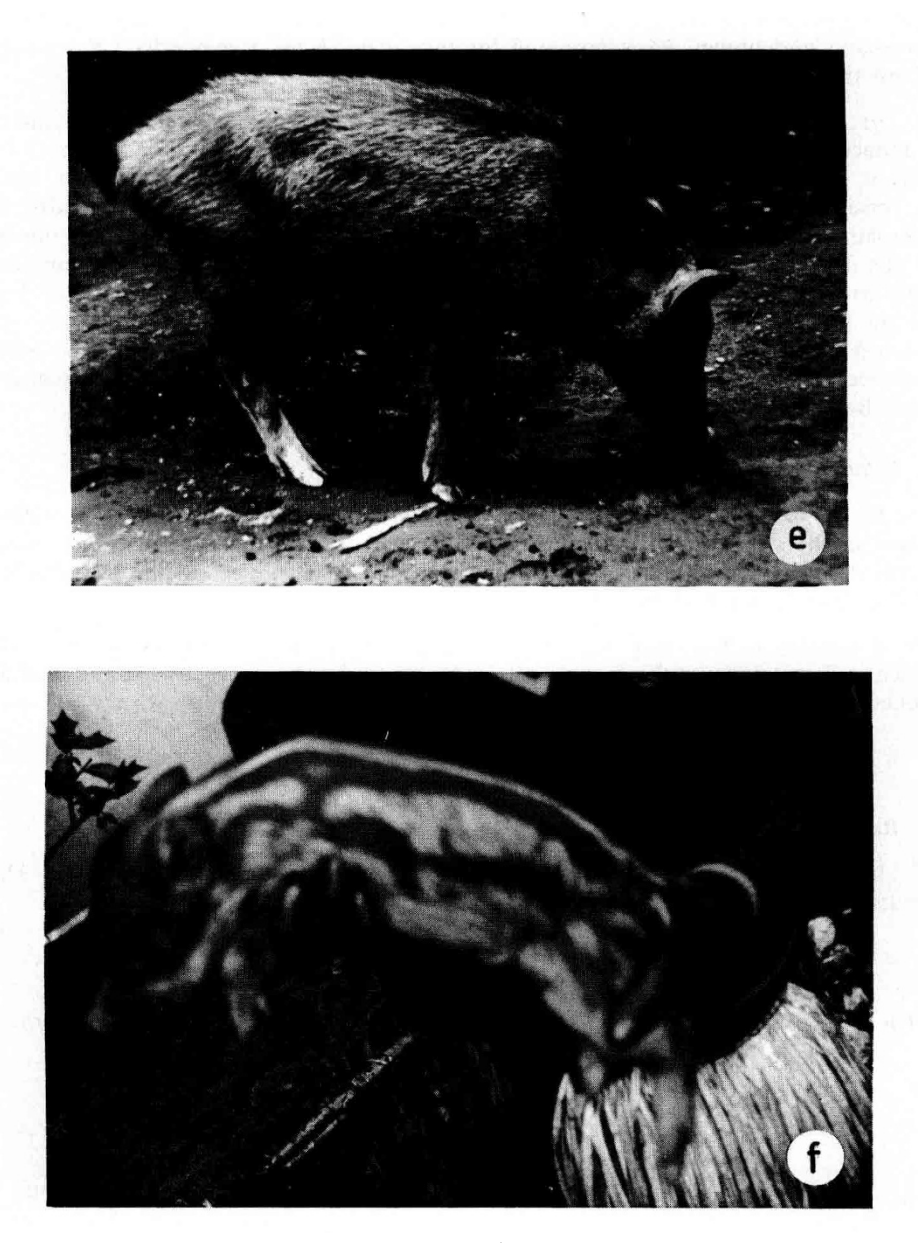
FIG. 2 (suite)