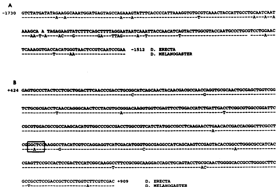
Fig 3. Comparison of the \alpha -amylase coding and intergenic regions of D erecta with the homologous sequences of the D melanogaster strain, Oregon R (Boer and Hickey, 1986). (A) Sequence from the intergenic region (see Fig 2 for location of this region). (B) Sequence from the coding region (see Fig 2). Only the nucleotides that differ from D erecta are shown for D melanogaster . The mutated Bam H1 site (Payant et al , 1988; and see discussion in text) is boxed. Sequences are numbered relative to the translation initiation site. Although sequence data were obtained for both copies of D erecta , only a single coding sequence is shown for this species; this is because both gene copies had identical sequences for this portion of the coding region (see discussion in text).