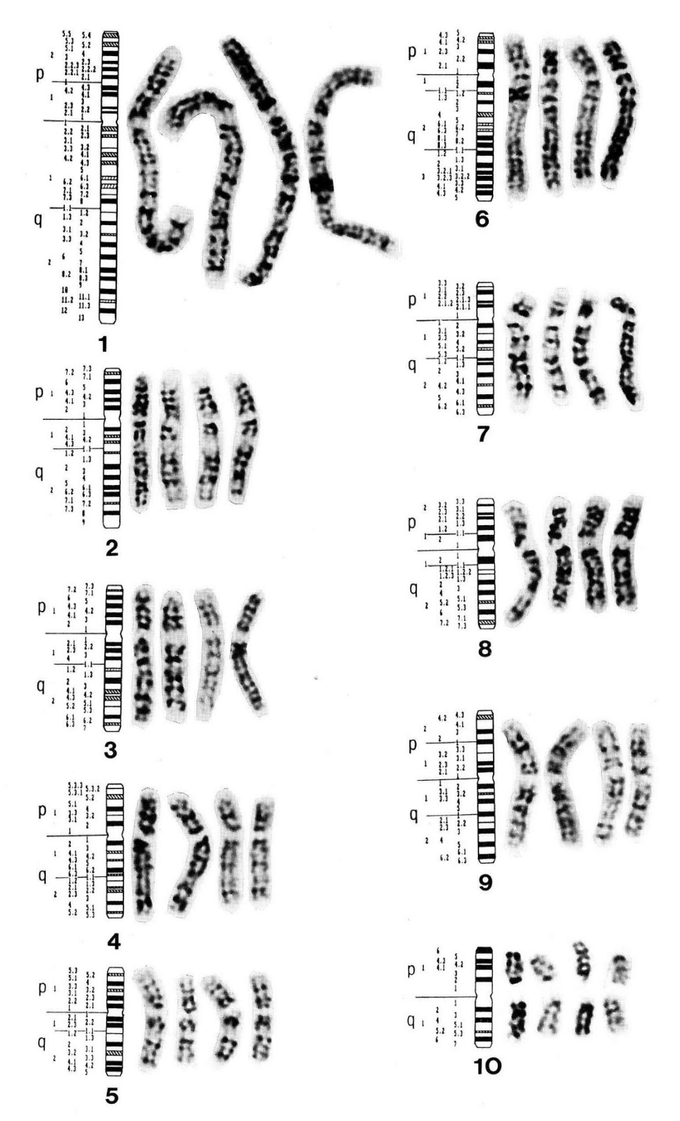
Fig 1. High-resolution GTG-banded chromosomes of the pig and their idiograms in the late prophase stage. The chromosomes represent composite sets from numerous cells. The idiograms, based on band measurements and on relative staining intensities, were made with the aid of an IBM PC computer. The longest horizontal lines indicate the position of the centromere.