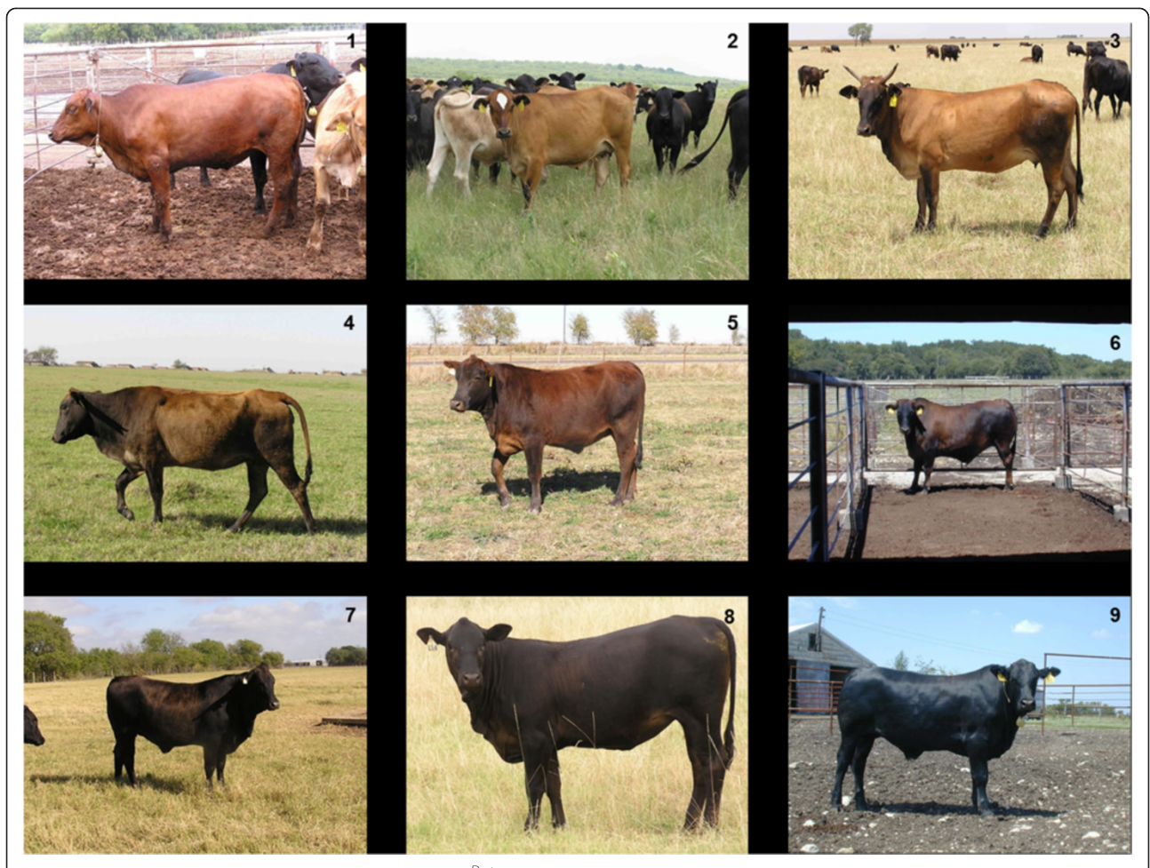
Figure 1 Degree of black scoring system. Examples of E^DE^+ F_2 Nellore-Angus cattle that scored a 1 through 9, respectively, starting at the top left and proceeding left to right down the rows.

every family was used for interval analyses by applying the full sibling additive and dominance models of GRIDQTL software [7], with 1 cM steps assuming 1 cM = 1 Mb, chromosome-wise significance thresholds established by 5000 permutations of the data, and the 95% confidence interval was established by 5000 bootstraps with resampling. Single-marker association analyses were performed using PLINK [8] for 39 480 SNPs with Bonferroni correction for multiple tests.