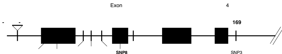
Figure 2. Polymorphism identified in the horse MATP gene. Exons are represented by black boxes and introns and UTR by lines. The relative positions of SNP are indicated. Exon and intron nucleotides are numbered from the first nucleotide of each exon or intron. Figure not drawn to scale.

SNP were searched in the mean time in introns and exons of the MATP gene by sequencing regions flanking the seven exons. Three SNP in the first intron (SNP2, 4 and 5), one SNP in the second intron (SNP1), and one SNP in the fourth intron (SNP3), as well as a 75 bp deletion upstream of the first exon (Fig. 2, Tab. V) were identified.